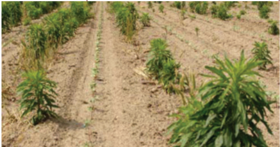
This cotton field is packed with glyphosate-resistant horseweed. This prolific plant has millions of seed.

"Fall applications will reduce overwintering horseweed populations, making them easier to manage in the spring. If a fall residual is applied, spring burn-