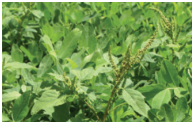
ALS-resistant pigweed has been found in peanuts in south Texas.

However, when quizzed about their practices to address or prevent glyphosate-resistant weeds, 23 percent of the respondents said they have implemented crop rotation strategies, 17