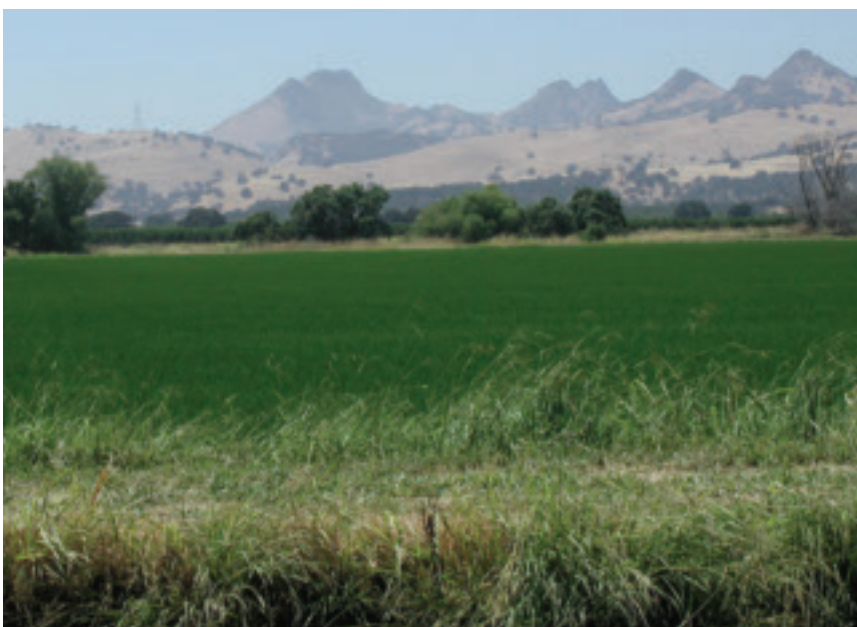
This rice field in Sutter County, California, was treated with Regiment CA and is weed-free compared to the untreated levees, which are covered in watergrass.