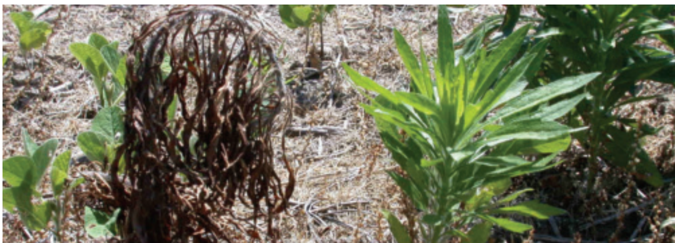
In this soybean field, the “good guy,” left, is a susceptible horseweed next to the “bad guy,” a glyphosate-resistant horseweed.